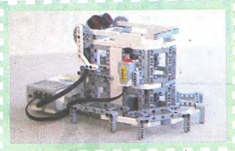
King's College Old Boys' Association Primary School No.2's "Tata Germs, Toilet"

Students from King's College Old Boys' Association Primary School No.2 showcased an innovative "Tata Germs, Toilet" – a smart device that can be installed on the toilet seat. Aside from auto-flushing, this brainchild also deploys artificial intelligence to adjust its self-cleaning function according to frequency of usage, significantly reduces user's contact with toilet seat.