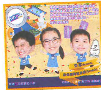
Tung Wah Group of Hospitals Tang Shiu Kin Primary School won the First Runner-Up & The Best Team Collaboration Award in Scratch Category

Students at Tung Wah Group of Hospitals Tang Shiu Kin Primary School, meanwhile, designed an exploration game so players can break a sweat and "travel the world" during lock down. Finally, students from Lok Wah Catholic Primary School introduced their "Pandemic Expert" app complemented with daily tips and special features like a map pinpointing infected persons' whereabouts.