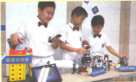
Chan Sui Ki (La Salle) Primary School's "Smart Home Pandemic Fighter"

Chan Sui Ki (La Salle) Primary School's "Smart Home Pandemic Fighter", on the other hand, reminded us to stay vigilant against the virus even at home. The door knob, smart garbage bins and other AI-fitted devices encouraged users to adopt habits like washing hands, showering, disposing their masks properly and more to minimise chances of infection while keeping the home clean.