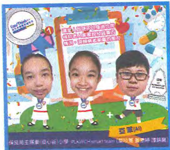
PLK Dr. Jimmy Wong Chi-Ho (Tin Sum Valley) Primary School, the First-Runner-up in App Inventor Category

To cater to the most vulnerable demographic, PLK Dr. Jimmy Wong Chi-Ho (Tin Sum Valley) Primary School designed an app to monitor the elderly's consultation and medication schedules with a voice-record function so all family members can stay abreast their conditions.