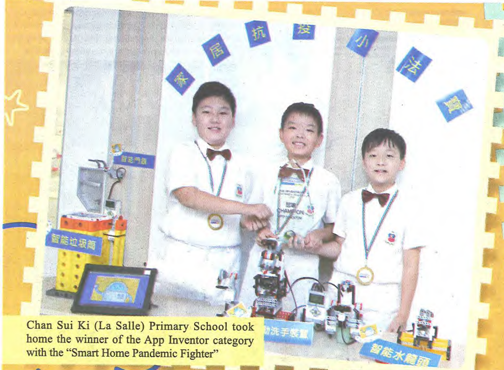
Chan Sui Ki (La Salle) Primary School took home the winner of the App Inventor category with the "Smart Home Pandemic Fighter"