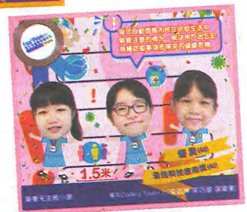
Lok Wah Catholic Primary School, the Merit winner & The Best Use of Technology Award in App Inventor Category

To cater to the most vulnerable demographic, PLK Dr. Jimmy Wong Chi-Ho (Tin Sum Valley) Primary School designed an app to monitor the elderly's consultation and medication schedules with a voice-record function so all family members can stay abreast their conditions.